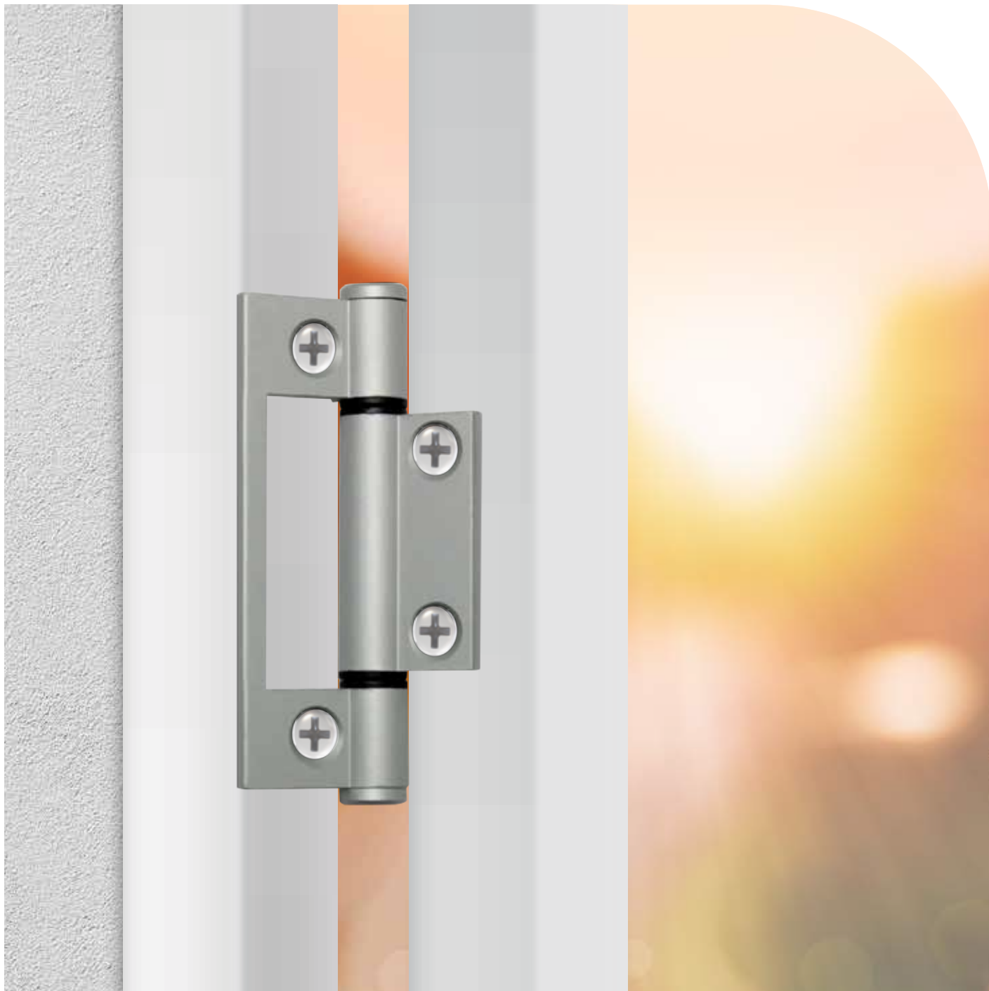
DH176 | ALUMINIUM INTERFOLD HINGE