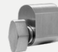
DN603 Turn knob

The cylinder plays an integral part in the operation of the DN970 Series. Manufactured from solid brass and available in keyed alike or keyed to differ key combinations in a 5 Pin C4 mechanism.