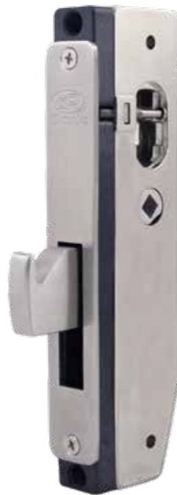
DN972/26 28mm Hook Throw Lockbody