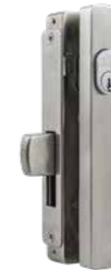
DN970/22E External - 22mm Short Throw