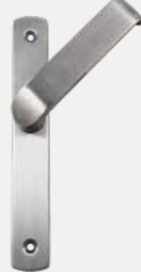
DN612 Strike Box