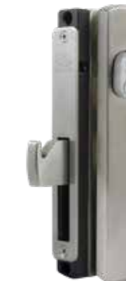
DN972/37E External - 26mm Hook Throw (Extended Backset)