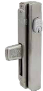
DN970/37E External - 37mm Long Throw