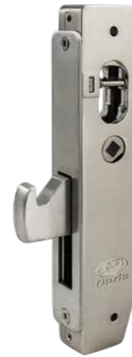
DN971/28 28mm Hook Throw Lockbody