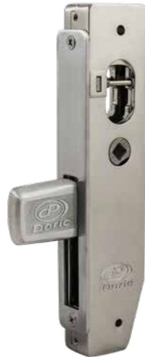
DN970/37 37mm Short Throw Deadlock