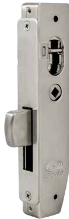
DN970/22 22mm Short Throw Deadlock