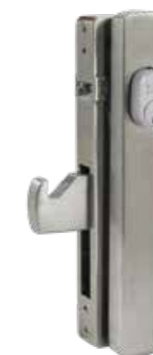
DN971/28E External - 28mm Hook Throw