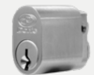
DN670 5 pin C4 Cylinder