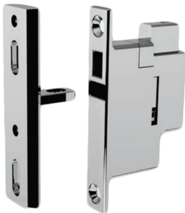
DS2266 3 Point Kit