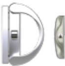
DS3522 Lock Set (Ext. cylinder only)