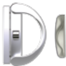
DS3521 Latch Set (without cylinders)

The Hamilton sliding patio door lock showcases the Doric modular 'Switch' chassis system. Stylish and contemporary in design, the Hamilton raises the industry standard for corrosion resistance and durability with the latest more environmentally friendly plating process of eSilver and eBlack. The Hamilton is developed using Doric Metacom™ metal alloy technology, a less corrosive material that will handle the tough New Zealand conditions.