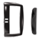
DS3621 Latch Set (without cylinders)

The Avon sliding patio door lock showcases the Doric modular 'Switch' chassis system. Stylish and contemporary in design, the Avon raises the industry standard for corrosion resistance and durability. The Avon is passes a 1000 hours in neutral salt spray testing providing excellent resistance to corrosion.