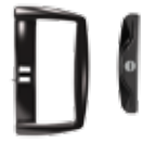
DS3622 Lock Set (Ext. cylinder only)