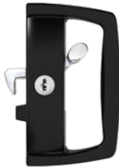
DS6005 Avon Handle Material: Zinc