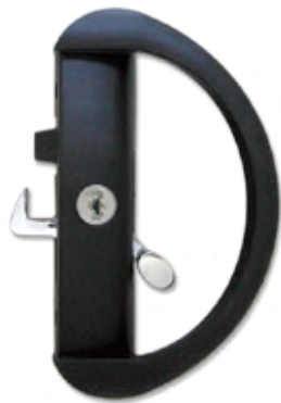
DS6001 Baron Handle Material: Polesium

DS6001 Baron and the DS6005 Avon sliding window locks made to suit the DS3521 Hamilton and DS3621 Avon sliding door locks.