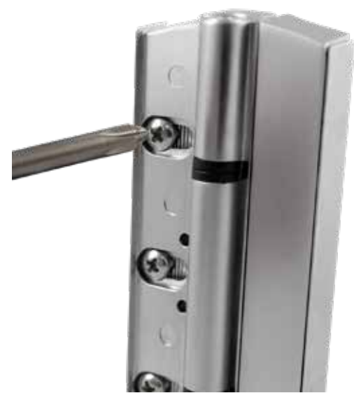
Adjustable by 6mm both vertically & horizontally