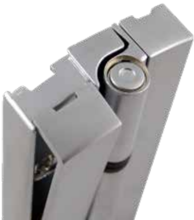
Easy to remove fixing cover plates