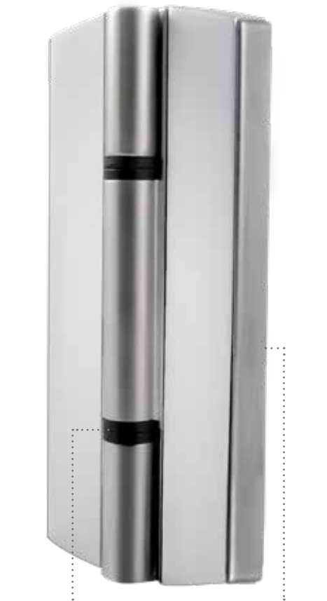
Improved bushes for support increase in weight