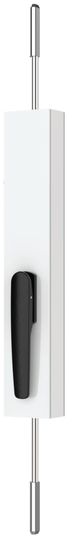
Latching (Non Keyed)