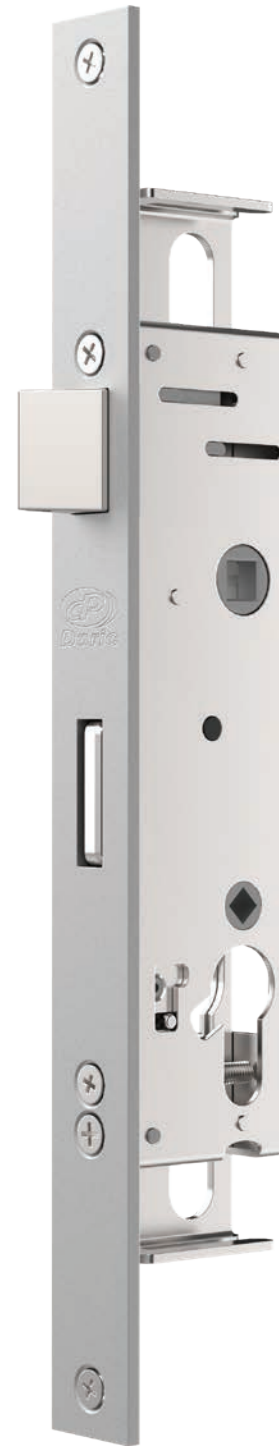
DS2800 LIFT TO LOCK MORTICE LOCKBODY